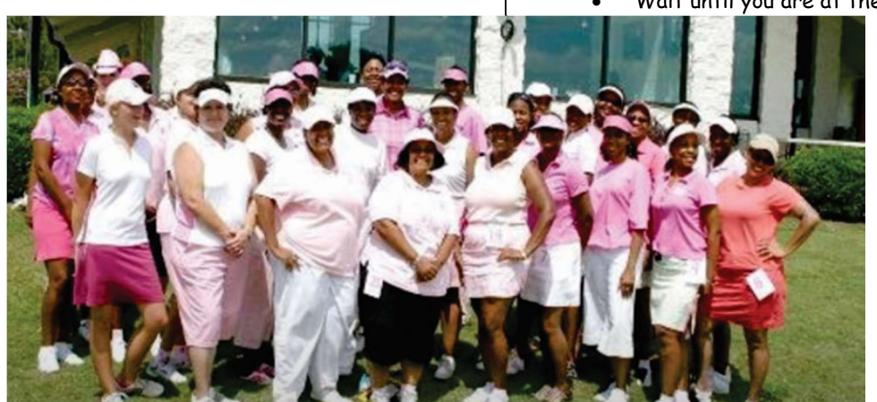
ELGL Rally for the Cure Tournament

• If there is a hole open in front of you, speed up. Don't wait for the ranger to tell you to do so.