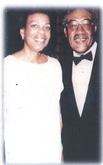
Another Moment We Share