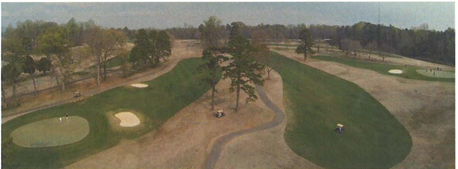
Dr. Charles L. Sifford Golf Course at Revolution Park Charlotte, North Carolina