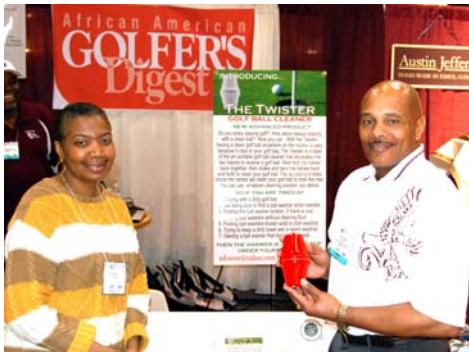
Exhibit your product or service with us onsite at the African American Golfer's Digest (AAGD) Diversity Pavilion during the 57th PGA Merchandise Show & Convention. Over 40,000 industry leaders, suppliers, buyers, merchandisers, trainers and PGA professionals attend this annual trade Show in 2009 and this year, even more are expected. This expo is the leading golf trade showcase and unmatched in the country.

BE THERE WITH US! The American Golfer's Digest Diversity Pavilion offers your company the opportunity to participate as a PREMIER ADVERTISER with the magazine and receive enhanced benefits that include an exclusive MARKETING OPPORTUNITY for exhibit space with us in the Products & Services section on the PGA Show floor. This golf-wide marketplace opportunity is affordably priced and specifically welcomes companies that are either owned by minorities and women or have expertise in reaching them. Our Diversity Pavilion provides the opportunity for face-to-face dialogue with key buyers, representatives and many other industry professionals who will be in attendance at the PGA Show.